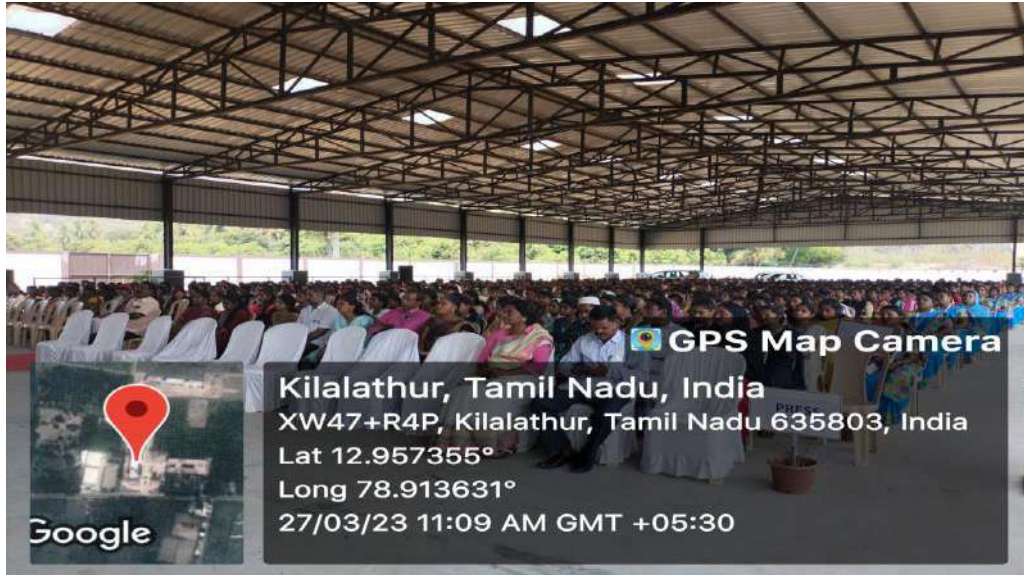
View of the Participants